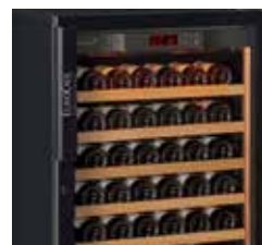
Full Glass door