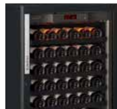
Black frame glass door